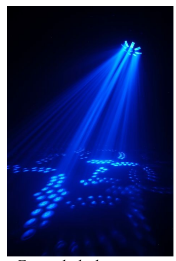
Example light patterns from tower

The artists will work with the at-risk students of the ALC to produce the bench cement forms, and with both the ALC and Brownie Troop 182 to produce the individual tiles specially designed for each bench (such as bats, lizards, plants). The artists will work with the residents of The Heritage at Gaines Ranch to mosaic the Austin based images onto the cement forms. This collaboration will provide a safe and positive avenue of artistic expression while bridging the social and generation gap between the groups.